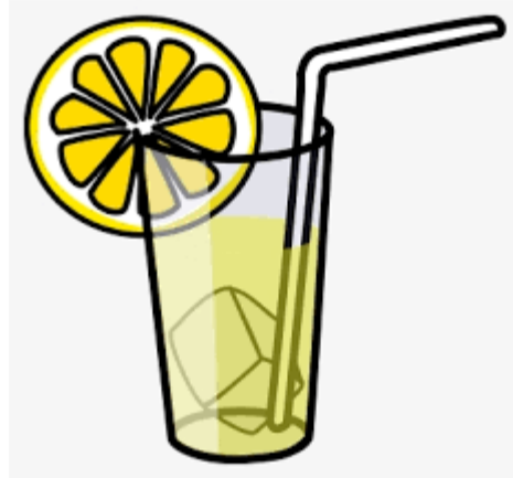
Don't use plastic straws