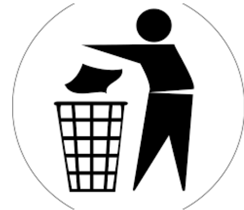
Always throw your rubbish in a bin