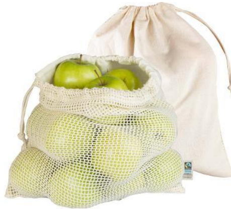
Use a reusable net bag for fruit and veg