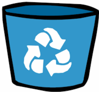
Recycle your rubbish