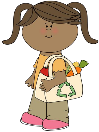
Use a reusable bag for shopping